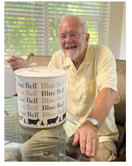
Smiles of Joy