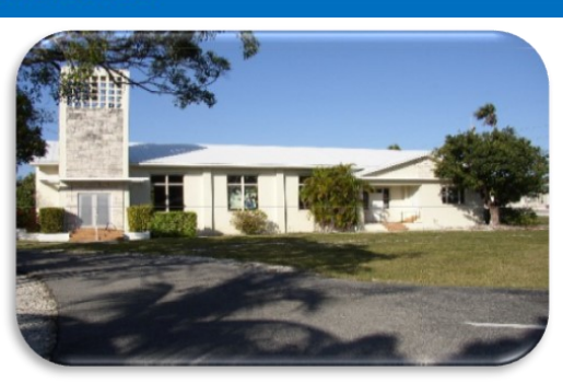
Worship Service Sunday - 11:00 am YouTube Services

Office hours – Monday, Tuesday, Thursday 8:30 a.m. – 1:30 p.m.