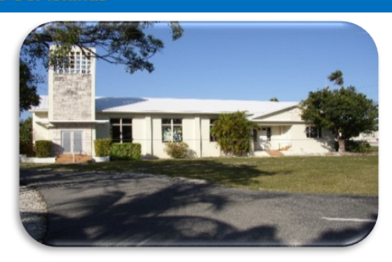
Worship Service Sunday - 11:00 am YouTube Services

Office hours – Monday, Tuesday, Thursday 8:30 a.m. – 1:30 p.m.