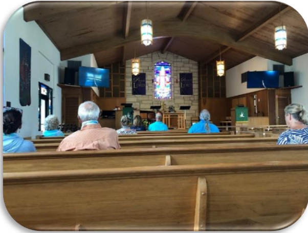
Social distancing was the order of the day