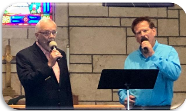
The congregation did not sing, but these two were great!