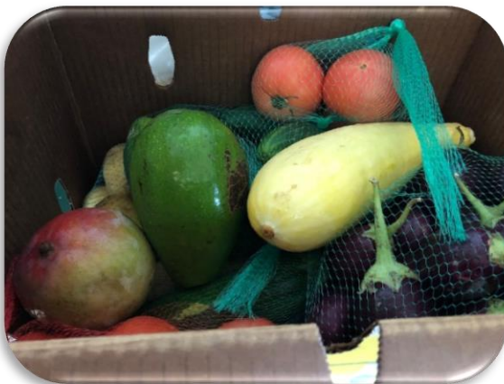
On Father's Day, boxes of produce were available at the church for our members from Mangrove Mike Endeavors: