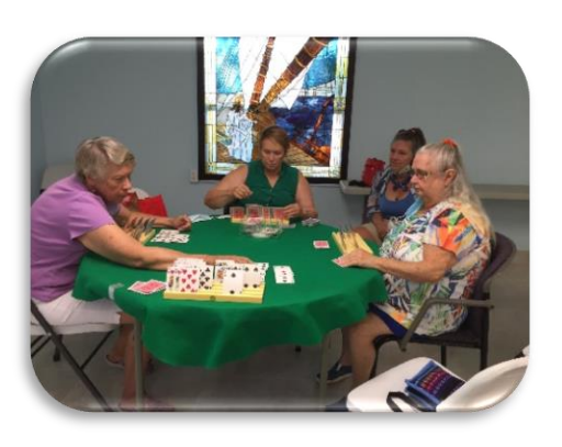
Tuesday cards resuming