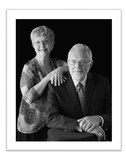
From the Pastor's Desk:

A few activities already resumed... check <u>calendar</u> in website for scheduled activities